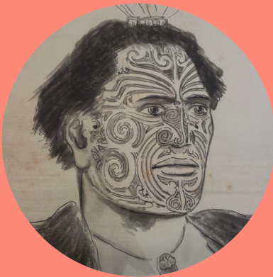
MAURI CROWN KING HONGI HIKA 1820