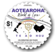
:Fee-freight-postage-$1-Gold-back[ed]-Aotearoha-stamp by the Perpetual--2020-Copy-right-now-space/copy-claim/ ~ RR368041275AU;