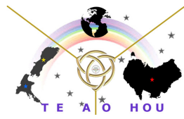
:Aotearoha-Crown-De-jure-Flag; Earth-of-Love & Peace-Land-Flag; Federal-Charter-Common-wealth-of-the-Earth-of-the-New-Order/Te-Ao-Hou by the Perpetual--2020-Copy-right-now-space/copy-claim/ -RPP4463800094001989678606;