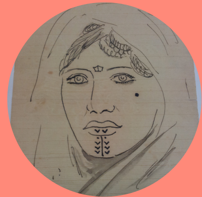
MAURI CROWN QUEEN TURIKATUKU II 1820