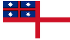
:Kotahitanga-[united]Tribes-Flag: ~1834/~1835 is: Free-the-world/Earth-Flag, Sea/Land-flag, Kings-two-party-contract-Creditors-Flag, Justice--4-Corners-of-Earth-Flag, Marshall-lore-Flag: Earth by the Perpetual--1834/1835-Copy-right-now-space/copy-claim/ -RPP4463800094001989677609;