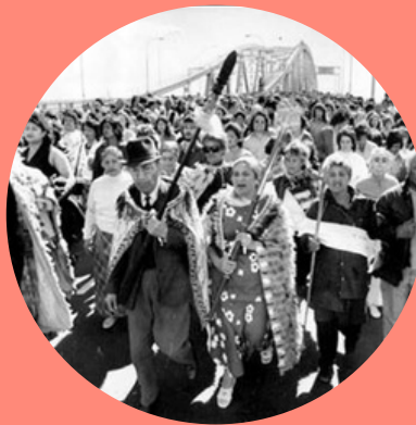
MAURI CROWN RANGATIRA 1975